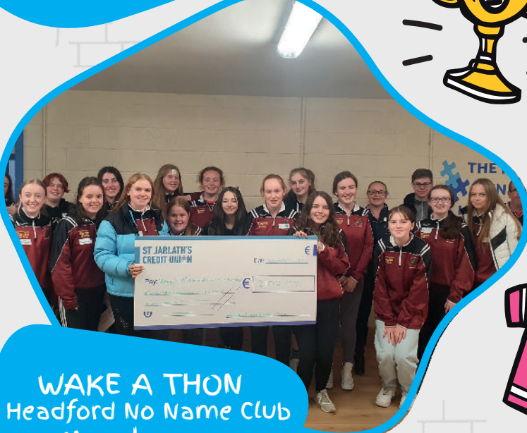
WAKE A THON Headford No Name Club March 2022