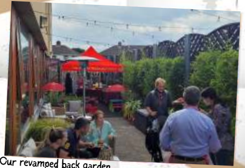
Our revamped back garden

Both areas look great and far more functional for families, but the main benefit we've seen is the quality family time and memories being made in the spaces. Barbecues, birthday parties, movie nights in and visits have been made so much better thanks to these revamped areas in the House.