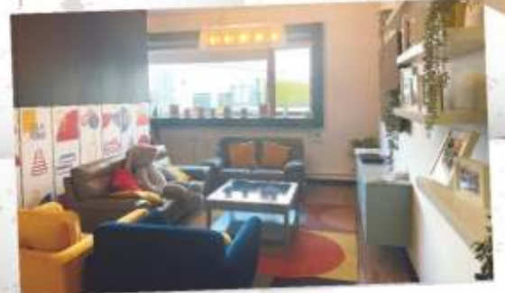
Our amazing refurbished sitting room!