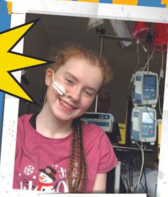
What a night! ❤️ The Harry Styles concert

I hope you can take a few minutes out of your busy day to have a read of all of the things that have been happening around the House over the last while. 😊