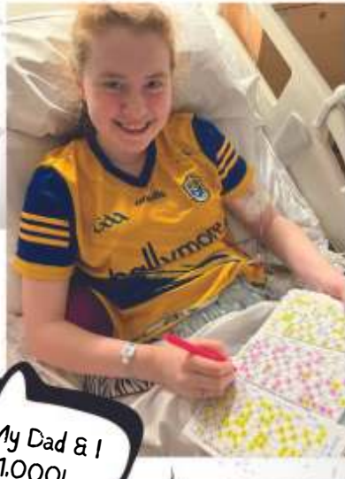
BINGO! My Dad & I won €1,000!