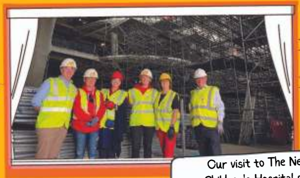
Our visit to The New Children's Hospital site

Things have been very busy behind the scenes of our New House project. It's been a long road and a lot of work from everyone involved, but we are thrilled to say that we have reached the end of the design stage of the project and are due to go out to tender in the new year.